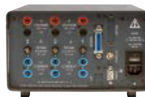
Fluke Norma 4000 (rear panel)

Each modular plug-in power phase consists of a voltage and a current measurement channel. Each measuring channel is available for each basic unit. However, only one kind of channel can be used per unit (see standard configurations).