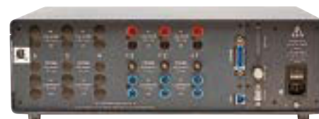
Fluke Norma 5000 (rear panel)