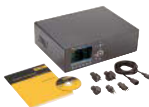
Fluke Norma 5000 Basic Configuration