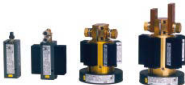
Optional shunts for Fluke Norma Series power analyzers