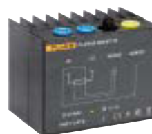
32 A Planar Shunt