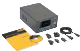
Fluke Norma 4000 Basic Configuration