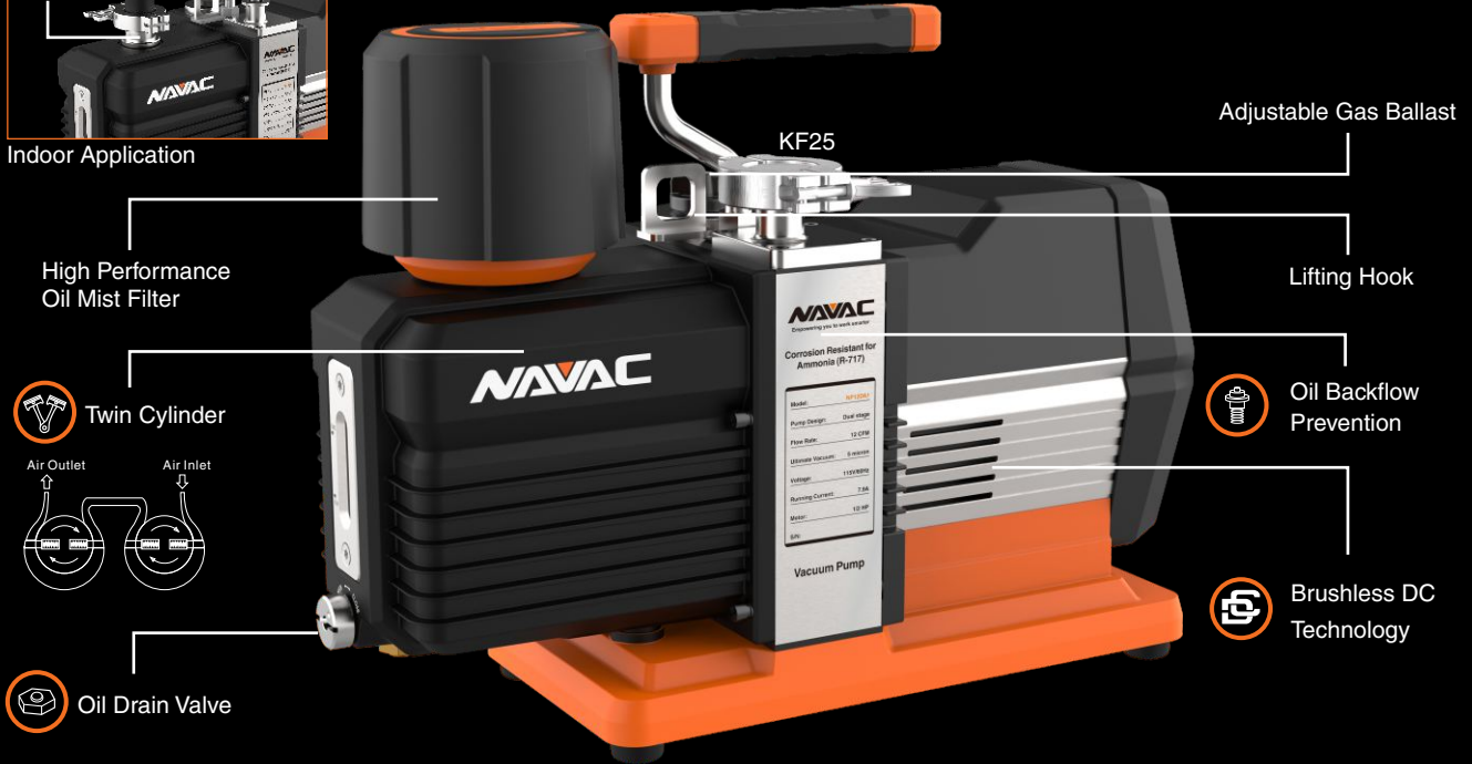
High Performance Oil Mist Filter