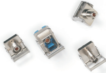
Optical adapters (2150)