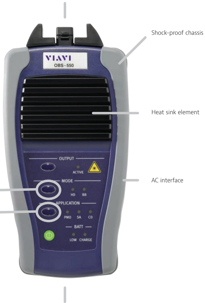
Interchangeable optical adapter system