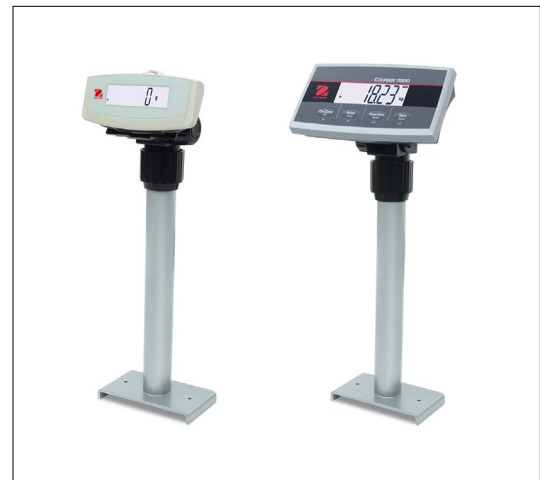
Optional Remote Display on column mount and Column Mount for scale indicator available