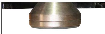
Stainless steel feet with rubber bottoms are attached to each load cell – ball-in-cup design makes feet self-swiveling and base easier to install