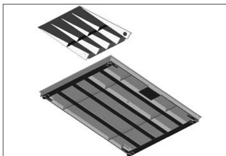
Design features welded steel ribs and channels for structural stiffness