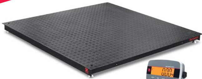
Powder coated carbon steel platform shown with i-DT33P indicator