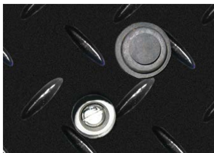
Top access to foot height adjustment screws makes leveling easy