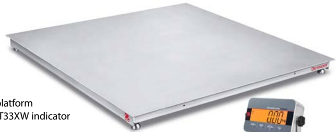
Stainless steel platform shown with i-DT33XW indicator