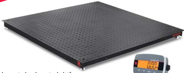
Powder coated carbon steel platform shown with i-DT33P indicator