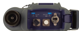
OLTS-85P quad connectors