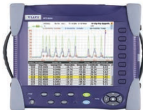
Scalable platform for multiple-layer and multiple-protocol testing