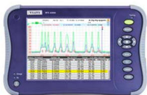
Modular platform for fiber and multiple-services testing