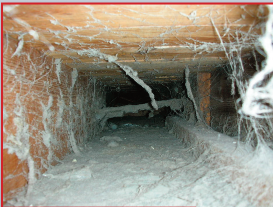
The VGA probes' four forward-facing LEDs and two rear-facing LEDs make the darkest crawl space as bright as day