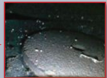
After pressing anti-reflection button (with mirror)