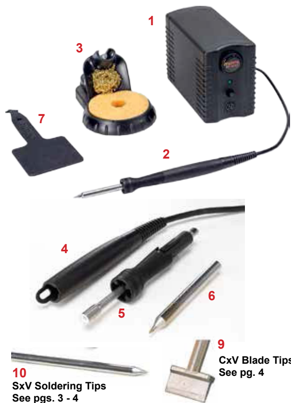
10 SxV Soldering Tips See pgs. 3 - 4