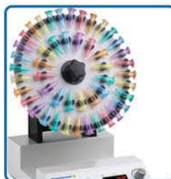
48 x 1.5ml (48 x 10-14mm tubes)