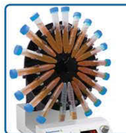
20 x 15ml (20 x 15-20mm tubes)