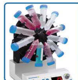
12 x 50ml (12 x 25-35mm tubes)

The Benchmark Rotating Mixer provides gentle to vigorous mixing of laboratory samples up to 50ml. With adjustable speed control and tilt angle, the Rotating Mixer is ideal for a variety of applications, from mixing blood samples to the preparation of homogenous dispersions.