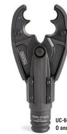
UC-60 O O and D3 Grooves