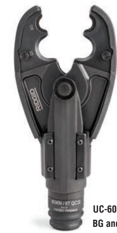
UC-60 BG BG and D3 Grooves