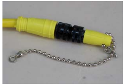
Umbilical with Shorting Cap