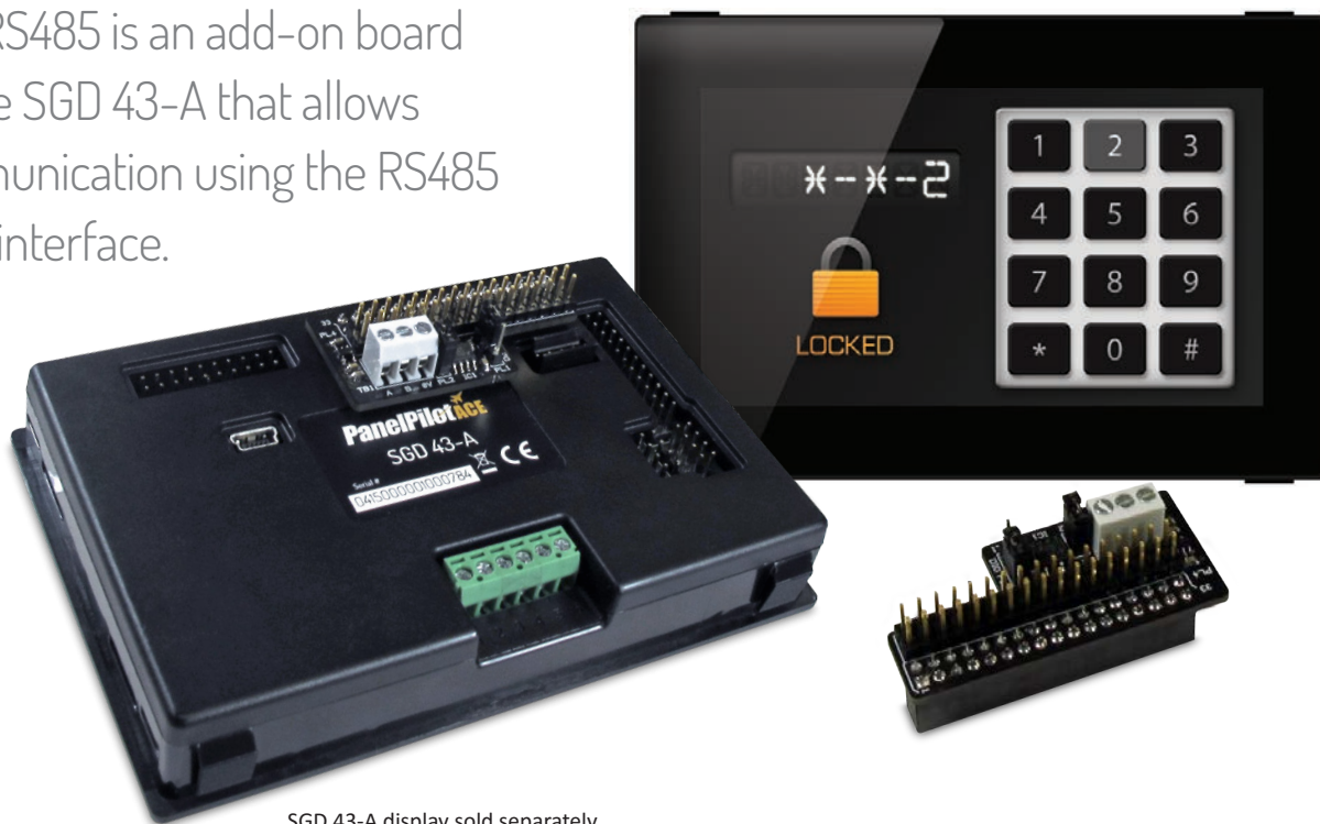
SGD 43-A display sold separately

S43-RS485 is an add-on board for the SGD 43-A that allows communication using the RS485 serial interface.