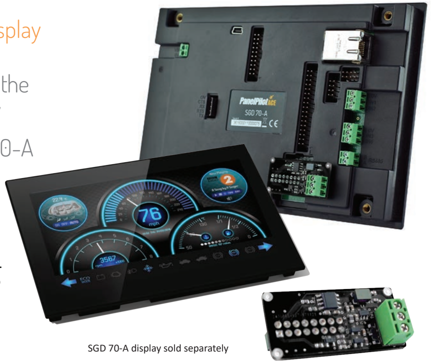
SGD 70-A display sold separately

The S70-CAN mounts on the rear of the SGD 70-A and provides a 3-wire CAN bus interface. It can be connected to via the CAN Hi, CAN Lo and GND pins.