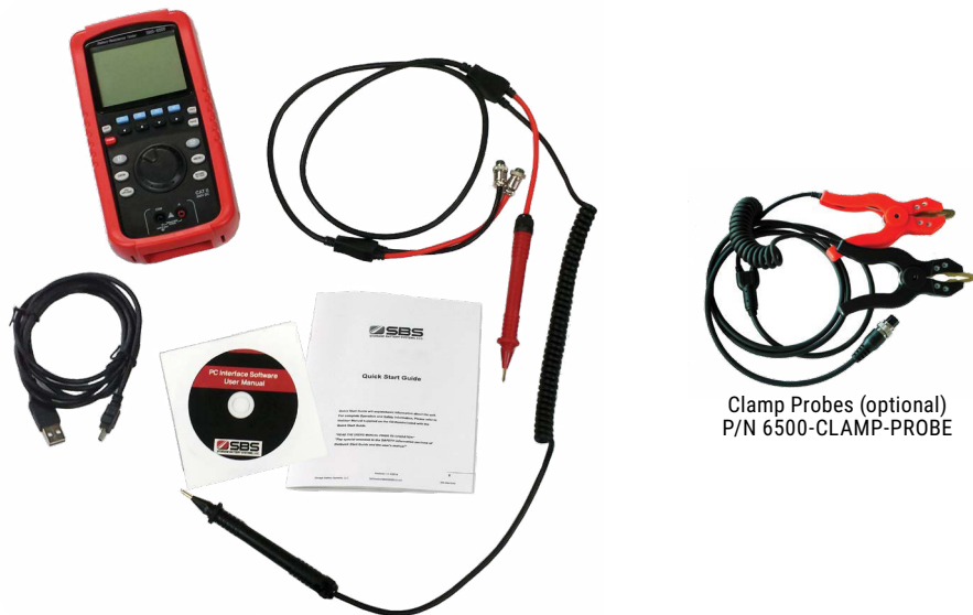
Clamp Probes (optional) P/N 6500-CLAMP-PROBE