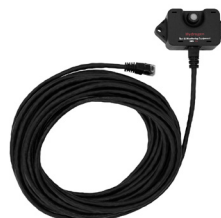
Additional Propane Sensor with 25 ft., 50 ft. or 100 ft. Cable