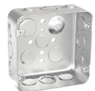
2-Gang Junction Box (Hardwired AC and/or DC)