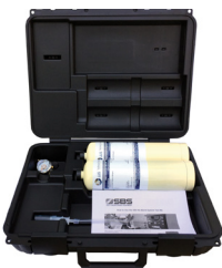
Test Kit (International orders ship without compressed gas)