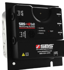
2-Gang Junction Box Hardwired AC and/or DC (optional)