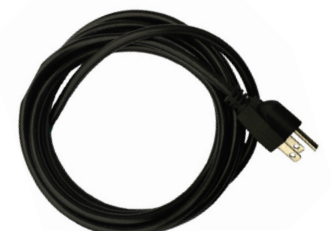
18 AWG AC Cord (optional)