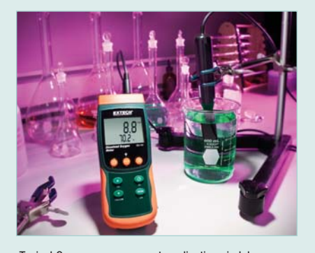
Typical Oxygen measurement applications in lab