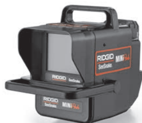
MINIPak Monitor Catalog No. 32748