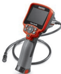
micro CA-300 Inspection Camera Catalog No. 37888