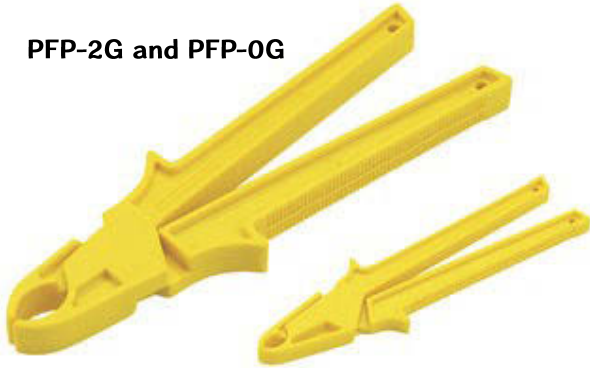
PFP-2G and PFP-0G