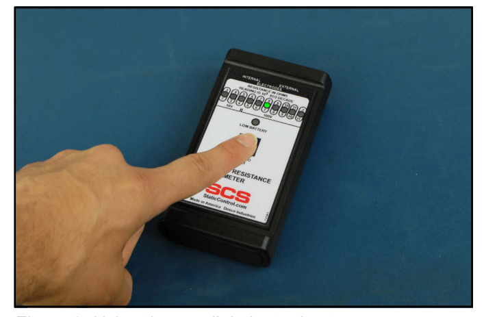
Figure 3. Using the parallel electrodes to measure surface resistance

If the measurement is outside acceptable limits, clean the surface with an ESD cleaner containing no insulative silicone such as Reztore™ Mat Cleaner, and re-test to determine if the cause of failure is an insulative dirt layer or the ESD worksurface material.