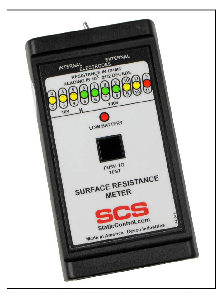
Figure 1. SCS <u>SRMETER2</u> Surface Resistance Meter