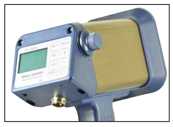
Operation Panel & Flash Adjustment Dial