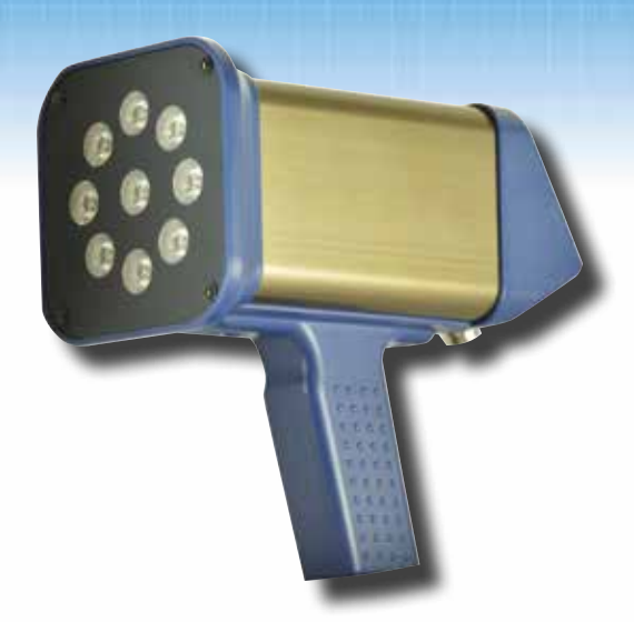
ST-320BL Black Light LED Stroboscope

The ST-320BL is designed for speed and frequency measurements in the printing, packaging, textile, automotive, cable, mining, steel, chemical, optical and medical industries in various applications.