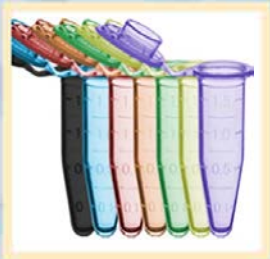
Also available in these great colors!

MTC Bio's SureSeal S™ microcentrifuge tubes are designed for a broad range of research applications, including enzyme digests, DNA isolation/purification, centrifugation, incubation and general sample/reagent storage. With a variety of design advances, SureSeal Tubes improve sample visualization, safety, stability and overall ease of use.