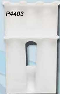
P4403 3-Place Rack up to one multi-channel