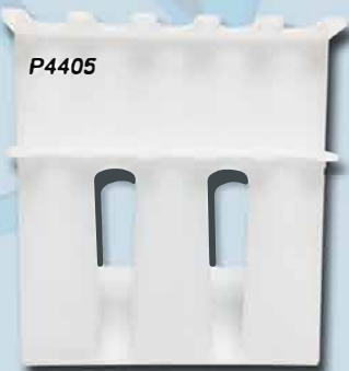
P4405 5-Place Rack up to two multi-channels

SureStand™ Pipette racks are unique in their ability to accommodate multi-channel pipettes without sacrificing any of the stability of a traditional acrylic rack. The patent pending "windows" allow the user to insert the multi-channel head longways through the rack, while keeping the body of the pipette stable by securing the pipette at two points; under the finger hook, and near the bottom of the handle.