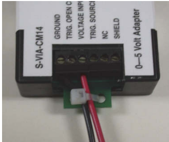
Cable Strain Relief

Use the included cable tie to provide strain relief to the cable (or individual wires), as shown below.