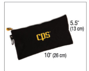
Cloth Storage Pouch