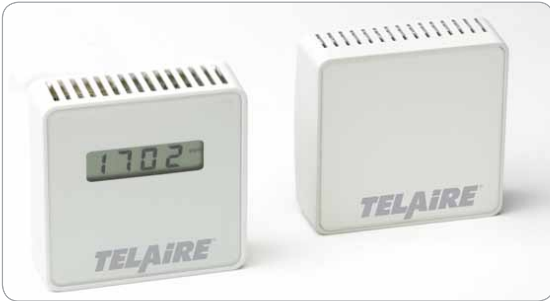
Dimensions: 81.4 mm x 86.4 mm

Smaller enclosure versions are available for regional preferences.