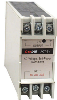
Conlab AC Voltage Transmitter

This document provides instructions on connecting the Conlab AC Voltage Transmitters listed above to HOBO U12, UX120-006M, MX1104, or MX1105 data loggers or ZW series data nodes via a 4-20mA cable. It also lists recommended configuration values to use for each transmitter when setting scaled values and units using HOBO software. Note: The Conlab transmitters are self-powered devices. For information on connecting the transmitters to the power source and other transmitter details, refer to the documentation provided by Conlab.