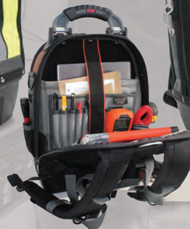
TECH PAC LT BACKSIDE