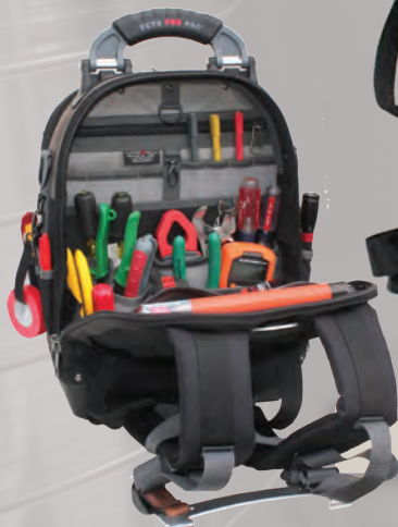
TECH PAC, CAMO & HI-VIZ BACKSIDE