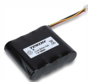
7.2V/5.2Ah Li-ion battery Pack