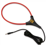
Rogowski Coil (200A)