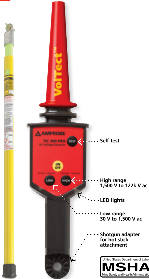
TIC 300 PRO