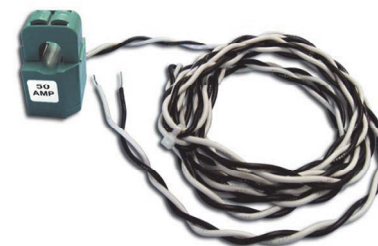
Magnelab Mini AC Current Transformer