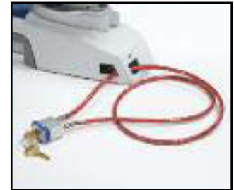
Security Device accessory (Lock & cable sold separately)