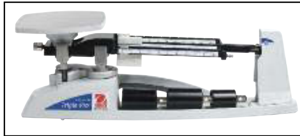
Three masses included with balance