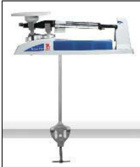
Included Rod & Clamp accessory for specific gravity experiments