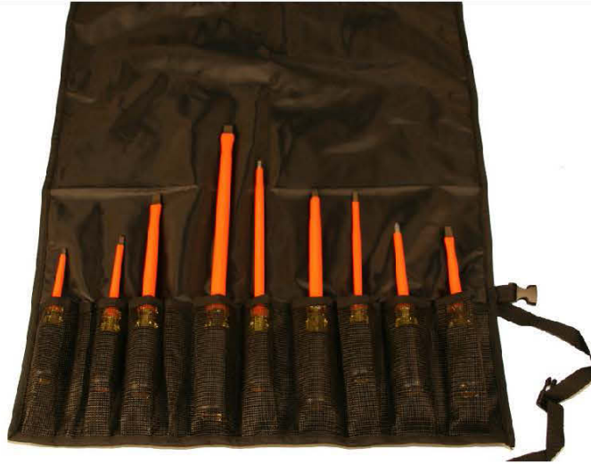
Image for illustrative purposes only— TR-9SD screwdriver roll pictured.