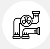
Water, wastewater and sewage