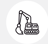
Outdoors facilities maintenance