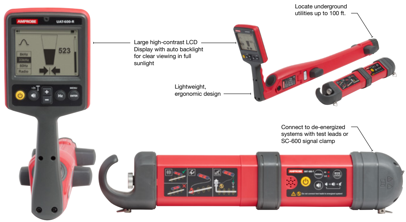
UAT-505 Underground Utilities Locator Kit

Safety Certification All Amprobe tools, including the Amprobe UAT-505, are rigorously tested for safety, accuracy, reliability, and ruggedness in our state-of-the-art test lab. In addition, Amprobe products that measure electricity are listed by a 3rd party safety lab, either UL or CSA. This system assures that Amprobe products meet or exceed safety regulations and will perform in a tough, professional environment for many years to come.