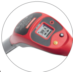
LCD Display with auto backlight to view clearly in bright sunlight