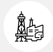
Electrical utilities distribution