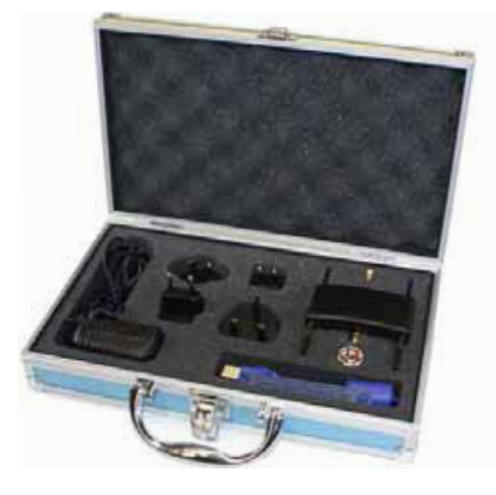
The transport case offers enough space for the preamp & accessories

The UBBV series enables maximum performance, particularly when measuring extremely weak signals e.g. in typical EMC test according to EN55022, EN55011 and so on.