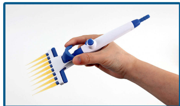
Shown with 8 Channel Pipette Tip Adapter (V0020-8)