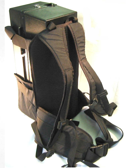
Optional Back Pack Harness