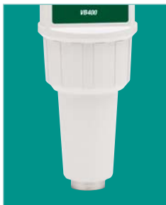
Magnetic base included