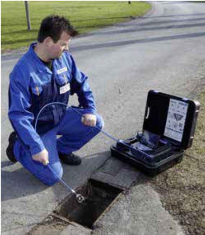
The 100 ft. push rod and the pan&tilt color camera head make sure nothing in the house supply line remains hidden from your view.