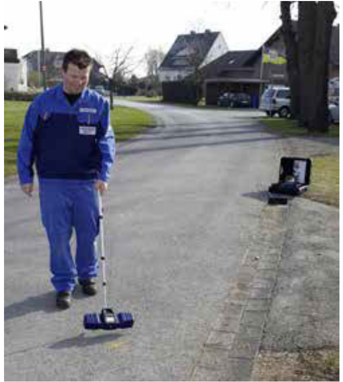
The Wohler VIS 350 precisely locates radio waves transmitted by the camera head through concrete and asphalt to save a lot of time and further building damage.