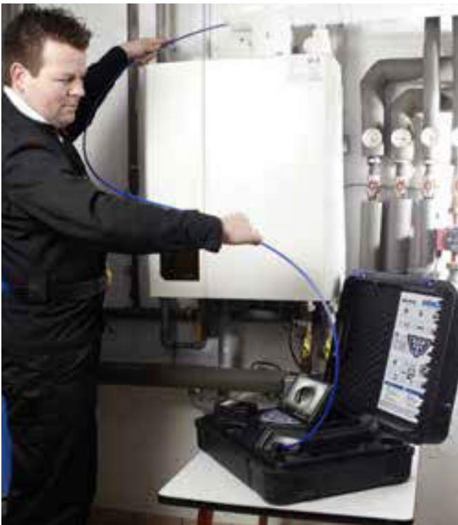
The 360° pan and 180° tiltable color camera head easily negotiates 90° bends.