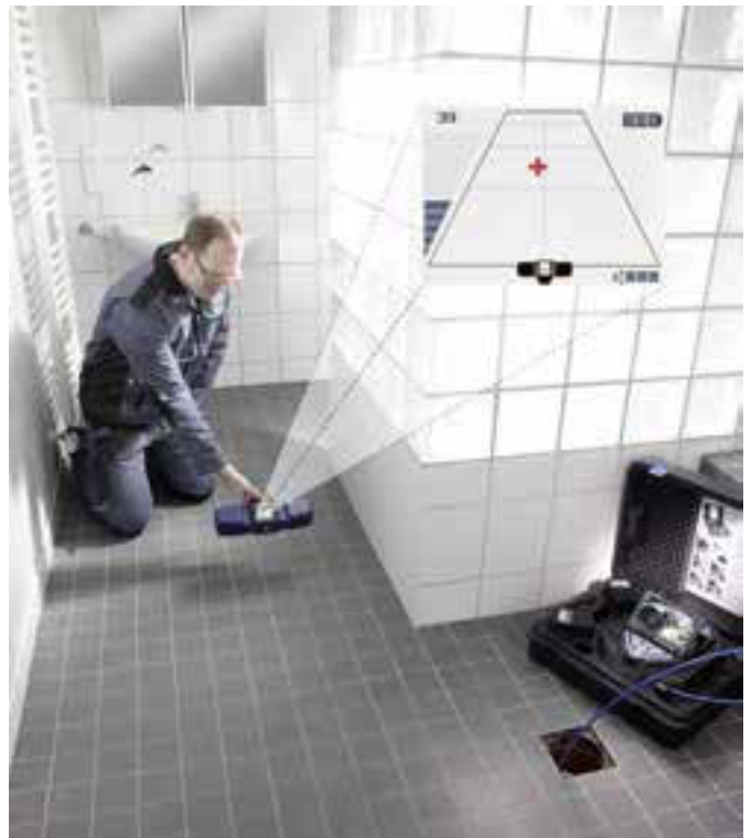
The actual meter count and the position of the head are displayed in the monitor. The Wohler L 200 Locator makes it possible to locate the camera head wirelessly.