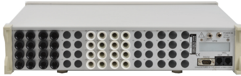
The 964i rear panel accommodates up to 60 output terminals. Unit shown above with 16 + terminals (HV) and 16 - terminals (return). The 964i ships with mating connectors for all +/- HV terminals 7KV and higher. Custom length HV lead sets are optionally available.