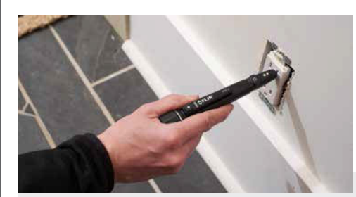
RUGGED AND RELIABLE Designed for long-term, trouble-free operation, the FLIR VP50-2 will last for years to come

The FLIR VP50-2 is a durable, CAT IV-rated non-contact voltage detector featuring light, vibration, and beeper feedback alarms and a powerful LED flashlight. Use the VP50-2 to reliably check whether an AC circuit is live before beginning work; detect voltage on exposed conducting parts or through insulation; identify live wires within switchboxes, switches, and outlets; or trace live wires and map circuits. With an ergonomic and drop-tested design, the FLIR VP50-2 is the right choice for professionals performing field troubleshooting and verification of electrical installations within residential, commercial, and industrial buildings.