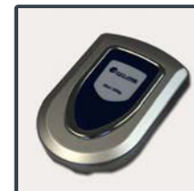
Protective cover (included)

Accuris Instruments offer a full line of Compact, Precision and Analytical Balances.