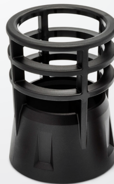
Part of Accessory Kit 2 WLACNSETHG2