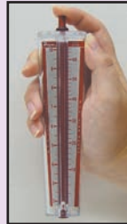
For high scale reading, finger covers hole.