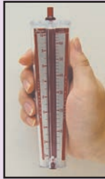
Hold this way for low scale reading.