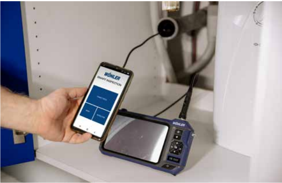
The images from the Wöhler VE 500 are also displayed in high quality on the smartphone. They can be conveniently sent from there.