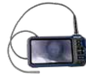
Wöhler VE 500 HD-Video-Endoscope