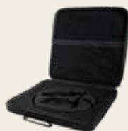
Large protective bag for Wöhler VE series and probes Article no. 10185