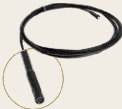
HD-Video-Endoscope-Probe (3 Cameras) Ø 7.9 mm / 10 m / 0° / 2 x 90° Article no. 11417