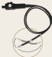
HD-Video-Endoscope-Probe (swivelling) Ø 6.2 mm / 1.5 m / 180° Article no. 11321