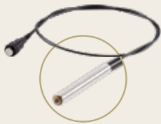
HD-Video-Endoscope-Probe Ø 3.9 mm / 1 m Article no. 6929