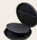
Protection bag for Wöhler VE series and probes Article no. 6914