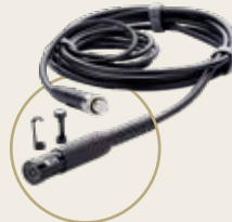
HD-Video-Endoscope-Probe (2 Cameras) Ø 8.5 mm / 3 m / 0° / 90° Article no. 11416