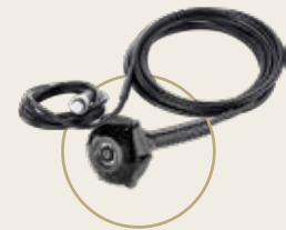
HD-Video-Endoscope-Probe Ø 25 mm / 3 m Article no. 6911