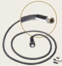
HD-Video-Endoscope-Probe Ø 5.5 mm / 1.2 m Article no. 7787