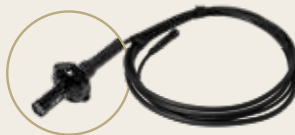
HD-Video-Endoscope-Probe (3 Cameras) Ø 25 mm / 5 m / 0° / 2 x 90° with roller guide Article no. 11419