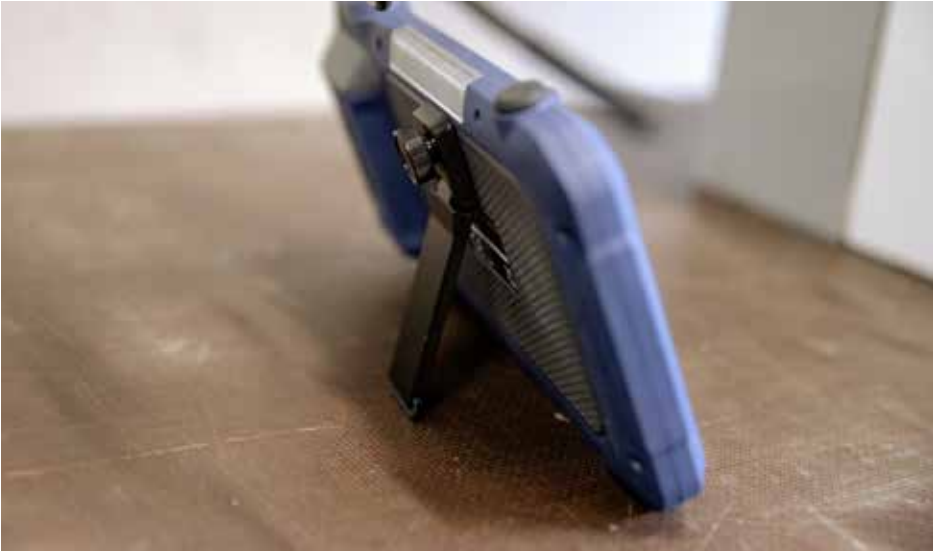
The supplied stand ensures that the monitor is conveniently positioned so that your hands remain free during the inspection.