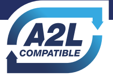
Series 41 P/N 42036