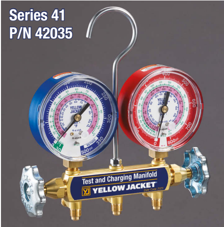
Series 41 P/N 42035