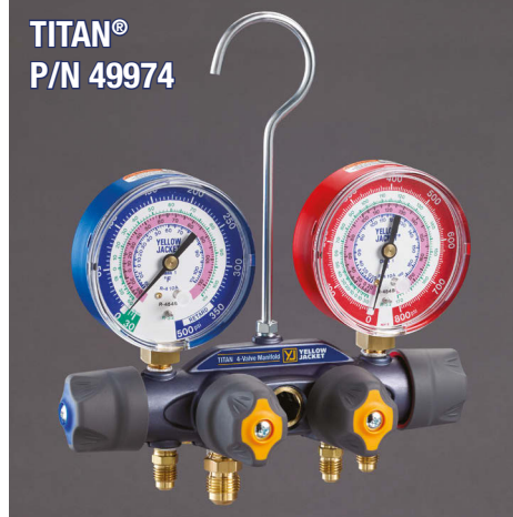
TITAN® P/N 49974