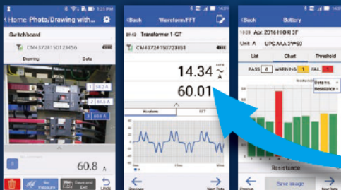
GENNECT Cross App