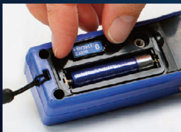
Easy set up