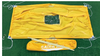
Displayed Partial Size: 47" X 25"

Protect surrounding areas from water spray when cleaning indoor mini-split evaporator coils, ceiling cassette units, or ductless outdoor building mounted condenser coils with the Mini-Split Catch All™.