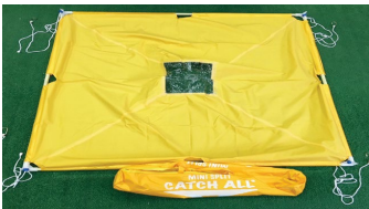
Displayed Full Size: 47" X 47"